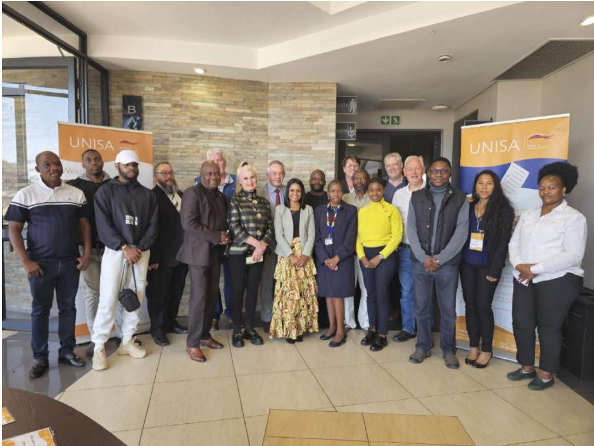
Participants in UNISA Hydropolitical Layer Cake Conference.

26 September 2024. The FSE presented the keynote address at the “Sharing Lived Experiences of Uranium-Exposed Communities – A Global Discussion” Conference. University of New Mexico, Pueblo of Laguna, and Red Water Pond Road Community. September 26-28, 2024.