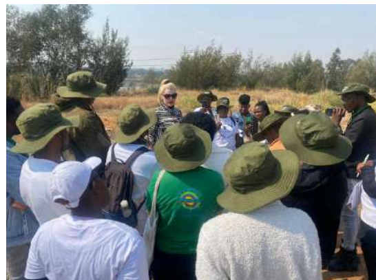
Visit of the Lancaster Dam and the headwaters of the Wonderfonteinspruit, Krugersdorp.