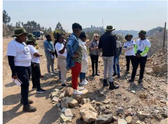
Visit of Pan African Resources' operations: Krugersdorp.