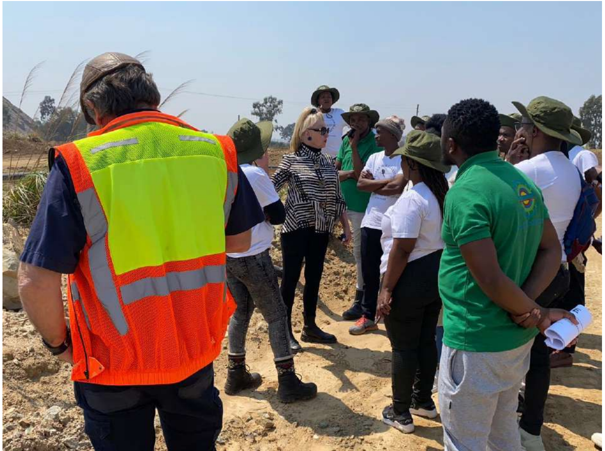
Visit of Rand Uranium's Sand Dump 20.