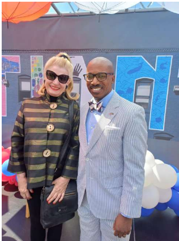
The CEO of the FSE with the US Ambassador