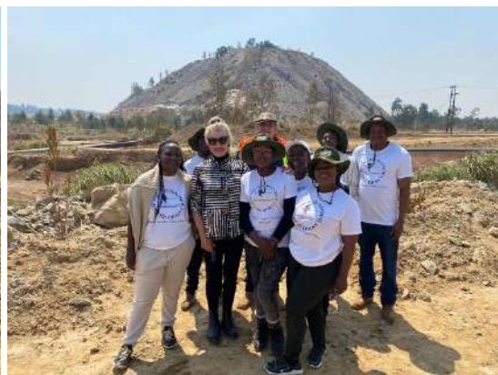
Visit of Sibanye-Stillwater’s Rand Uranium operations.