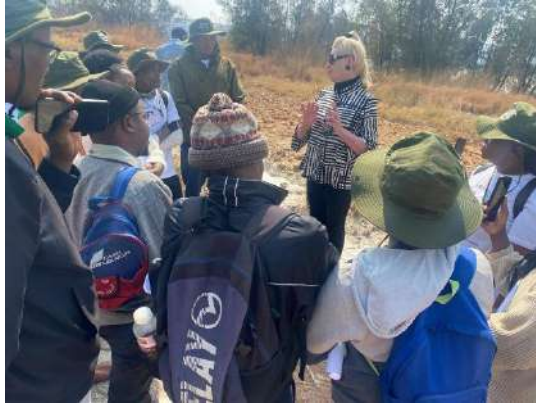
Visit of Pan African Resources' Mogale Retreatment project.